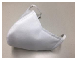
Examples of community cloth masks